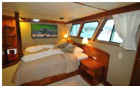
From top: Reina Silvia cruising in the Galápagos Islands. Top deck's covered lounge and bar. Dining area. Stateroom 1 configured with king bed.